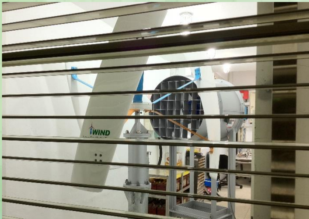
Testing Module of Wind Generator

Research : Power System Stability and Renewable Energy.